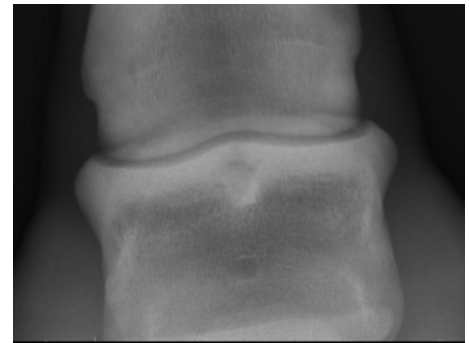
Figure 3 : Proximal Sub-Chondral Bone Cyst of the Second Phalanx July 2005

The horse continued recommended physical therapy and returned to competitive activity within 45 days of stem cell therapy. Radiographic evaluation of the right hind limb in July 2005 revealed resolution of the subchondral defect. The underlying cancellous bone showed adequate opacity and the chondral surfaces showed no indication of compromise (Fig 3). At the time of this evaluation, the colt had returned to full activity and was actively competing.